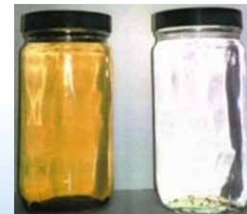
Before and after water samples treated with our OxyPlus™ System.